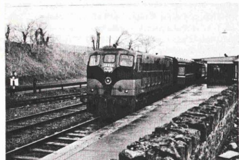
Top: 144 at Ballina, 16.4.90

Credits..... Pink Floyd "Obscured by Clouds" Free "Fire & Water" Miles Davis "A kind of Blue" Alice Cooper "Billion Dollar Babies" Beggles "Age of Plastic" The Galt "Electric"