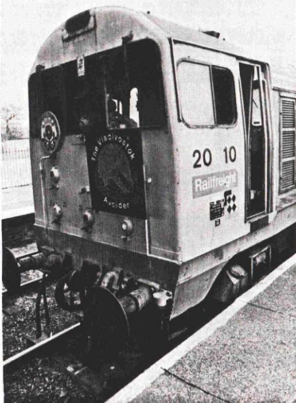
20.010 rests at Bridlington before the dash down to Hull on the Vladivostok Avoider. 12.5.90.